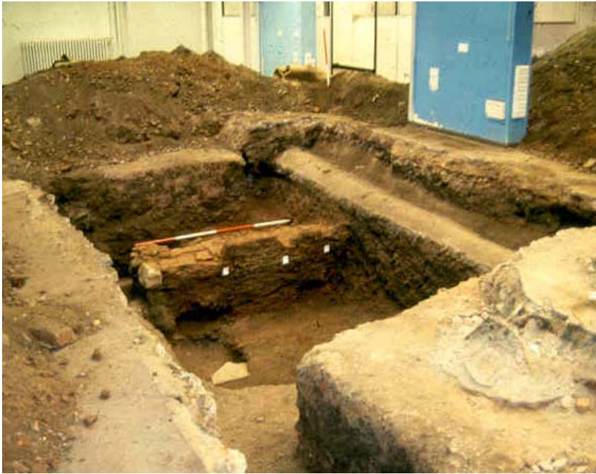
Part of a medieval tile kiln excavated at 9-10 The Tything (Worcestershire Historic Environment and Archaeology Service)